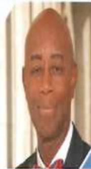
Rear Admiral Barry C. Black (Ret.)