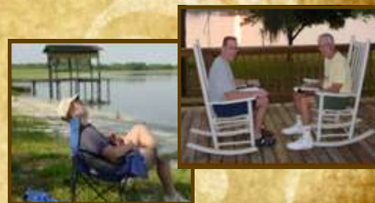
Fellowship & Relaxation