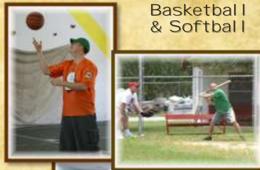
Basketball & Softball