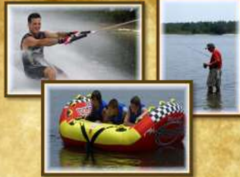
Water sports, Fishing, Swimming